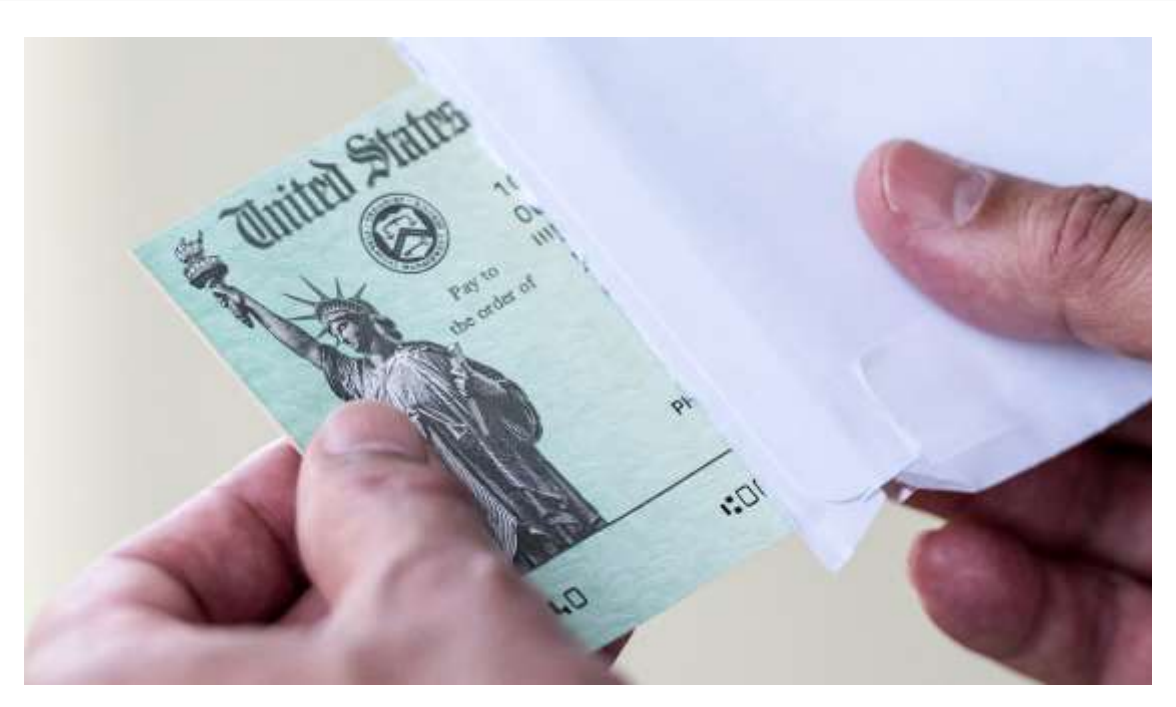
The IRS is also warning about stimulus check scams. Check out this article on the AARP website by clicking the picture above!