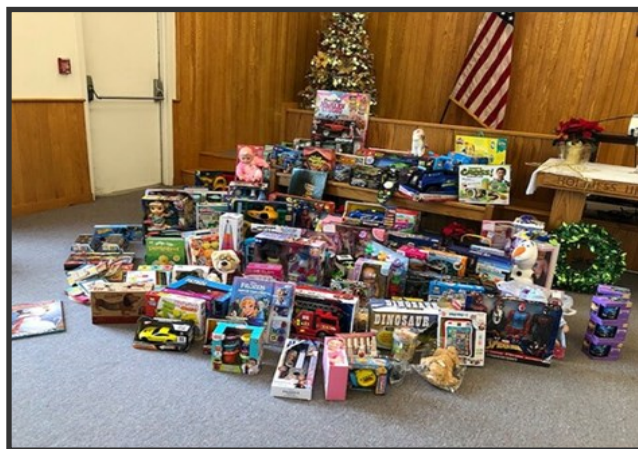
Salvation Army display of many of the over 200 gifts donated by RMC members